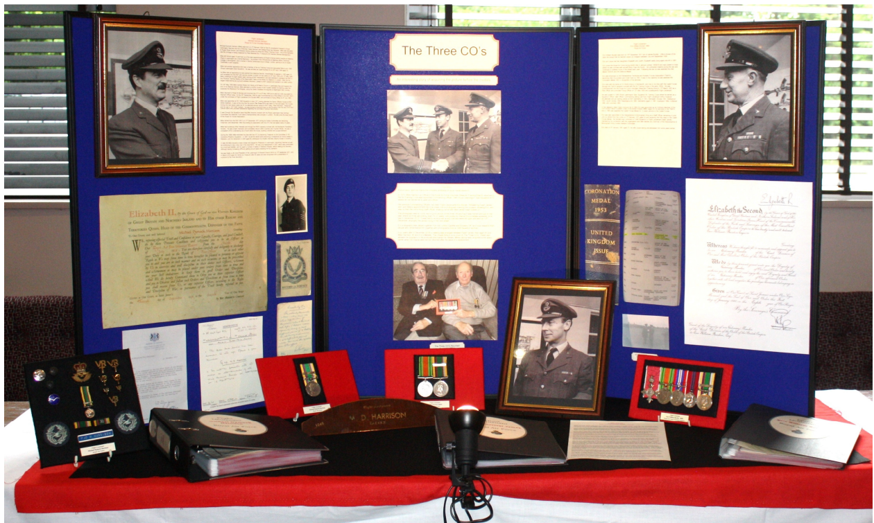
The President's Cup Winner 2016 The Three CO's

See below for some photographs from the day.