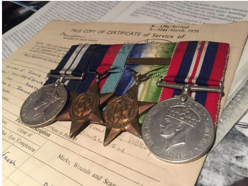
DSM group to a RM for Walcheren