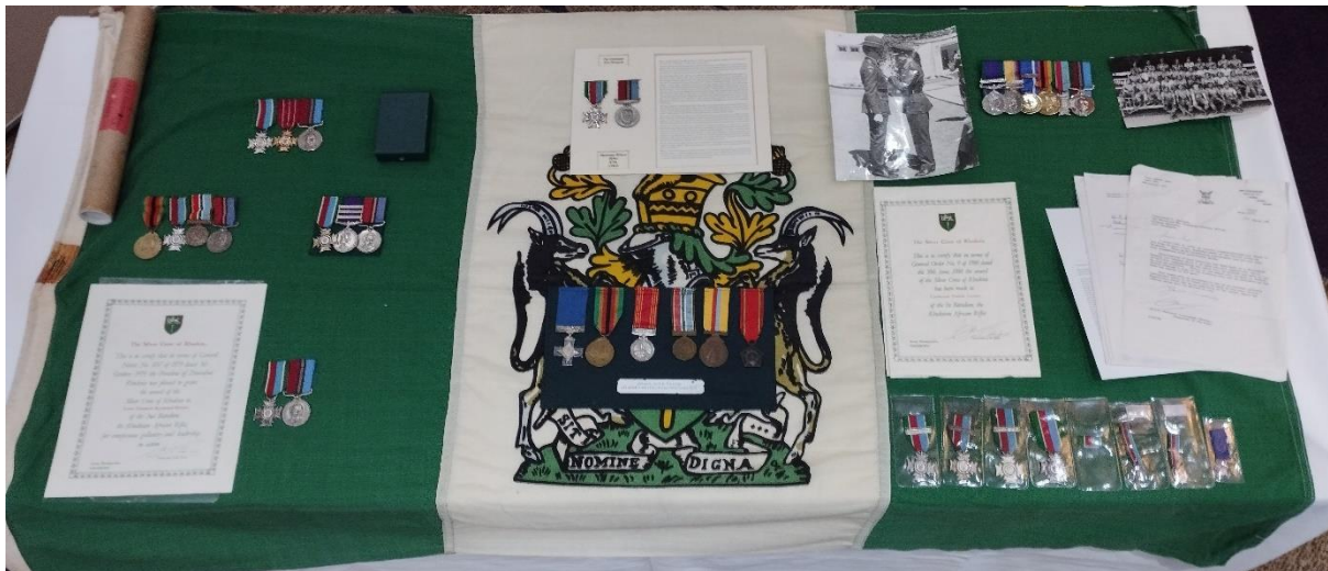
Photo above: Montage of medals, documents and photos on the backdrop of the Rhodesian flag. From the presentation 5 th March, 2026 by Rhys Fitter.

In the early 1960's, there was increasing pressure being put on British colonial countries by both the UK and the USA to replace colonial rule with proportional representation. This was unacceptable at the time to most of the of the white voters who were by far the minority at that time in Rhodesia. The Rhodesian Prime Minister Mr Ian Smith declared a Unilateral Declaration of Independence from Britain on 11 th November, 1965. This act was not considered kindly by the British government who immediately placed political and trade sanctions on Rhodesia. With the reduction in the arms supply to Rhodesia and increasing tensions from neighbouring countries [most of whom had already gained their independence], the conflicts for the defence of the Rhodesian's homeland started to build up.